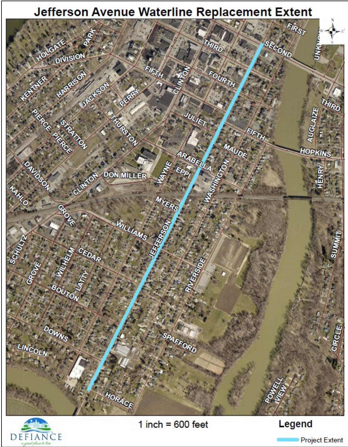
Figure 2. Water line replacement project area along Jefferson Avenue