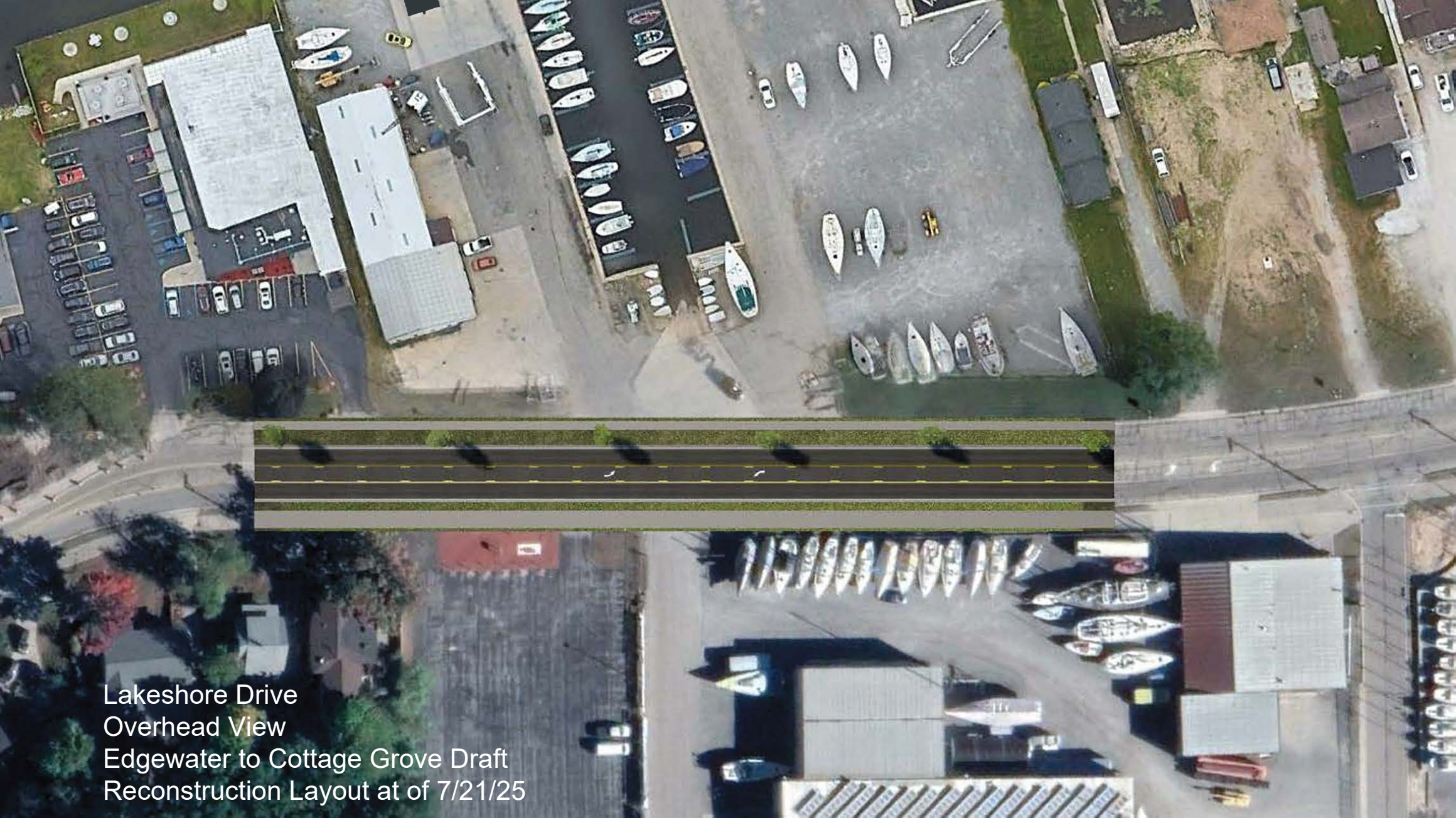
Lakeshore Drive Overhead View Edgewater to Cottage Grove Draft Reconstruction Layout at of 7/21/25