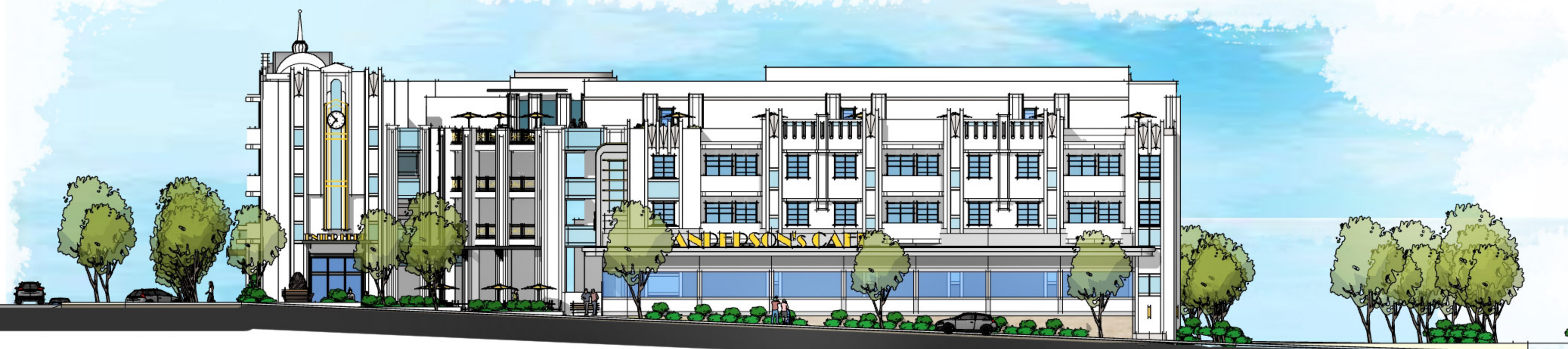
3 SOUTH ELEVATION 1/8" = 1'-0" (24 X 36 SHEET)