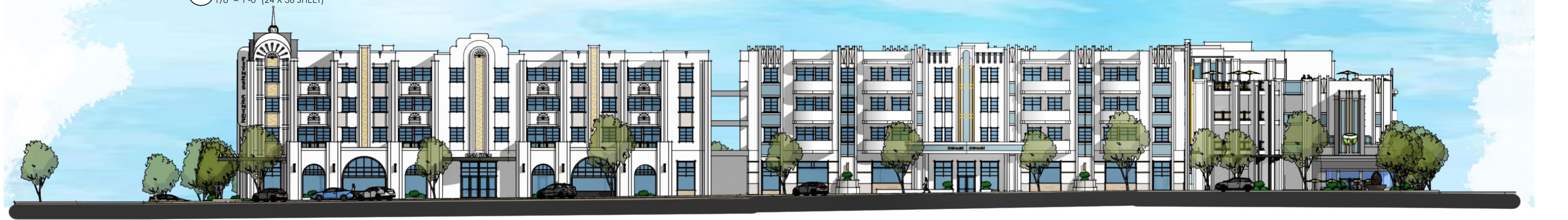
1 WEST ELEVATION 1/8" = 1'-0" (24 X 36 SHEET)