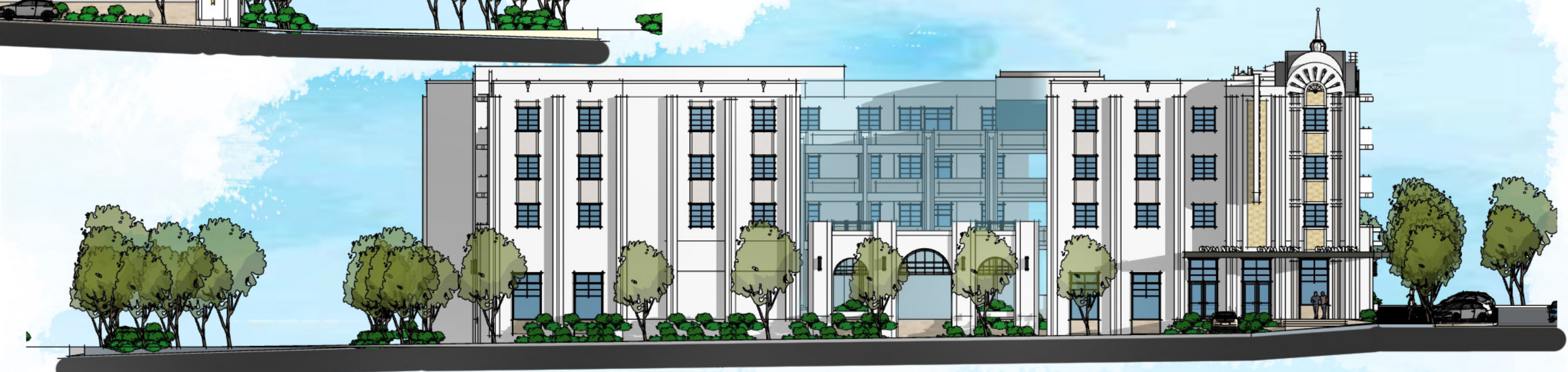
2 NORTH ELEVATION 1/8" = 1'-0" (24 X 36 SHEET)