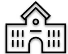
Colleges & Universities