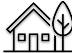
Direct to Families and Students