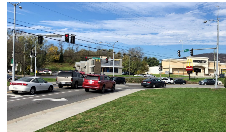
King Street at Orange Avenue (Route 460)