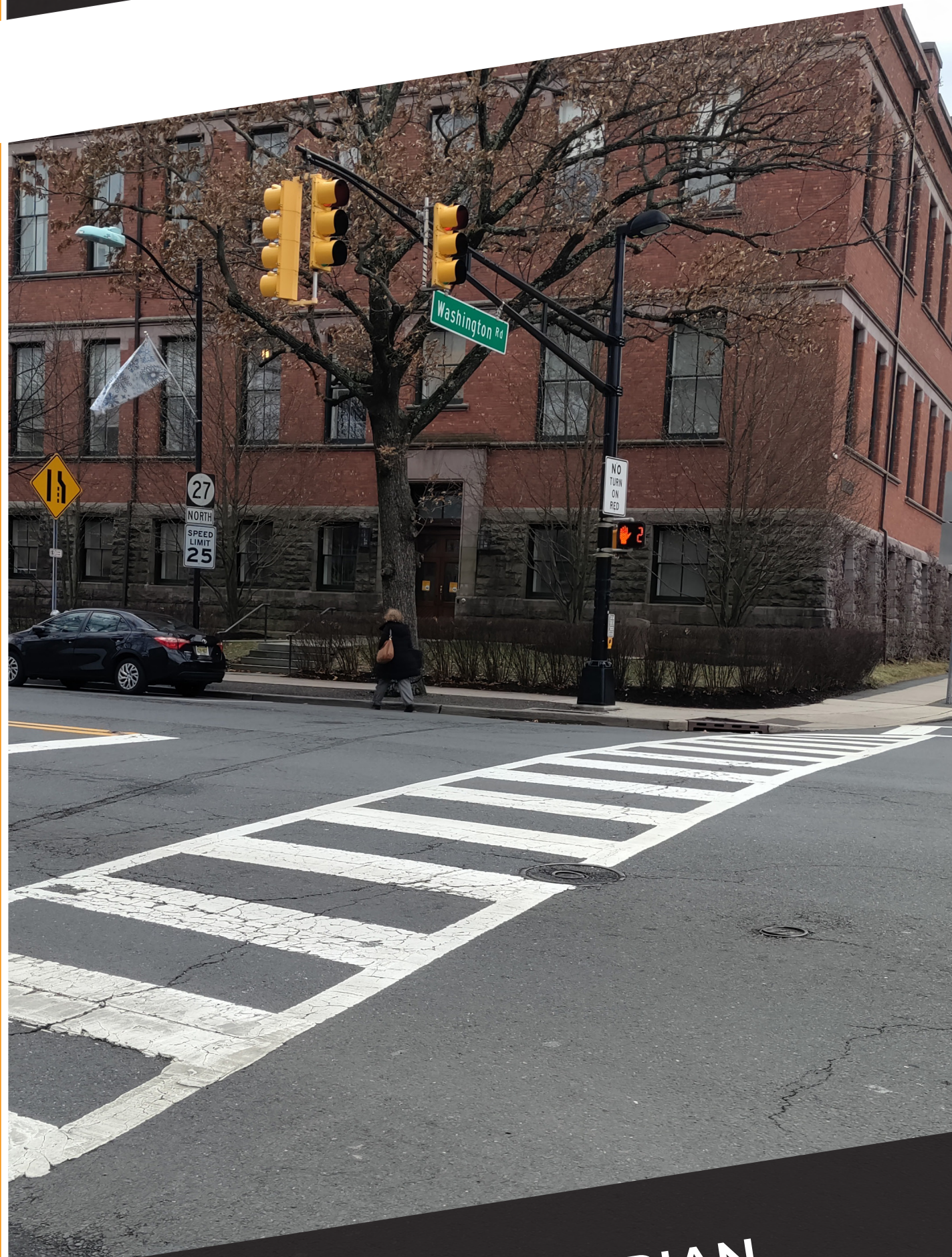
LONG PEDESTRIAN CROSSINGS