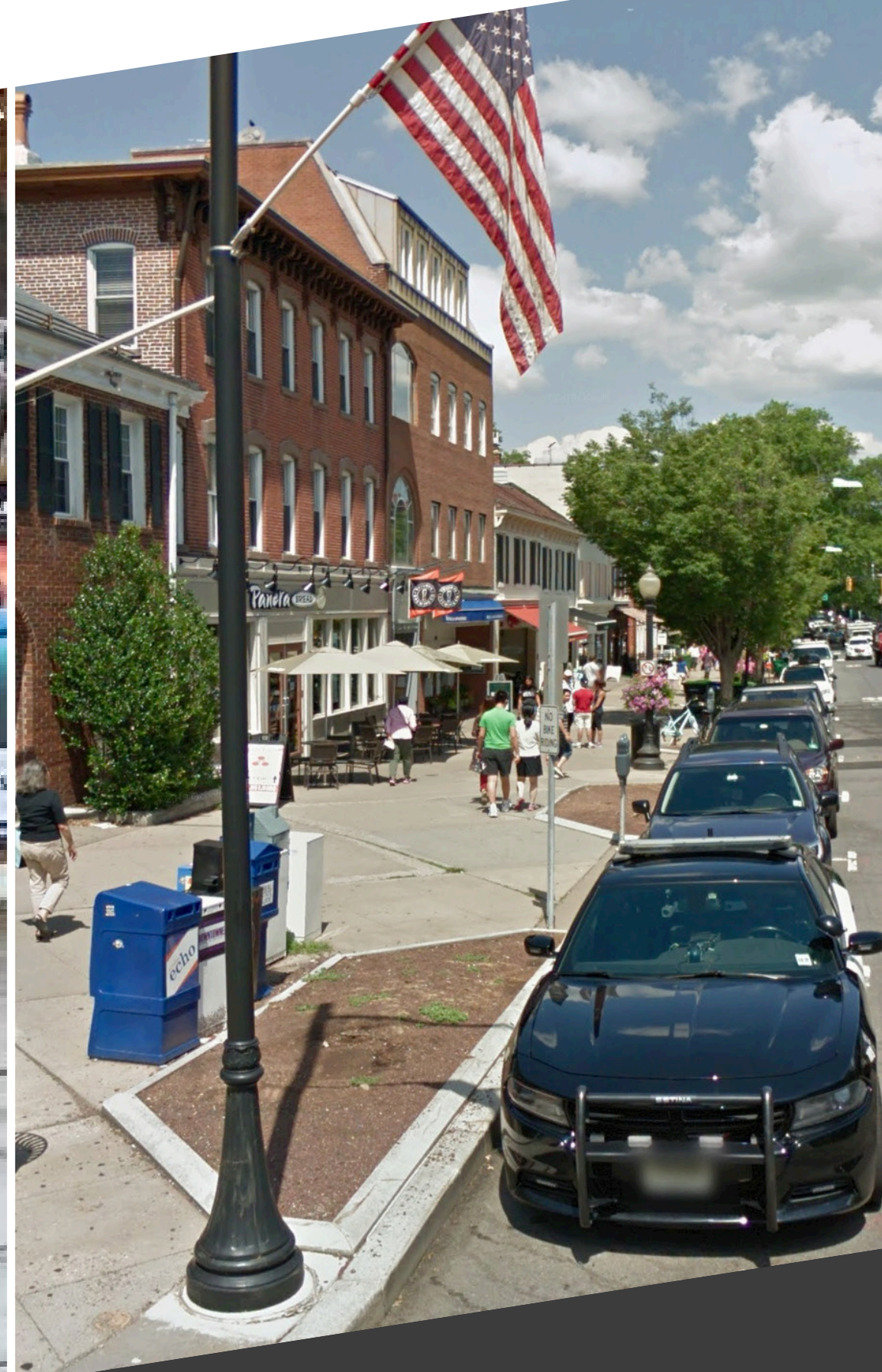
MISSING TREE CANOPY