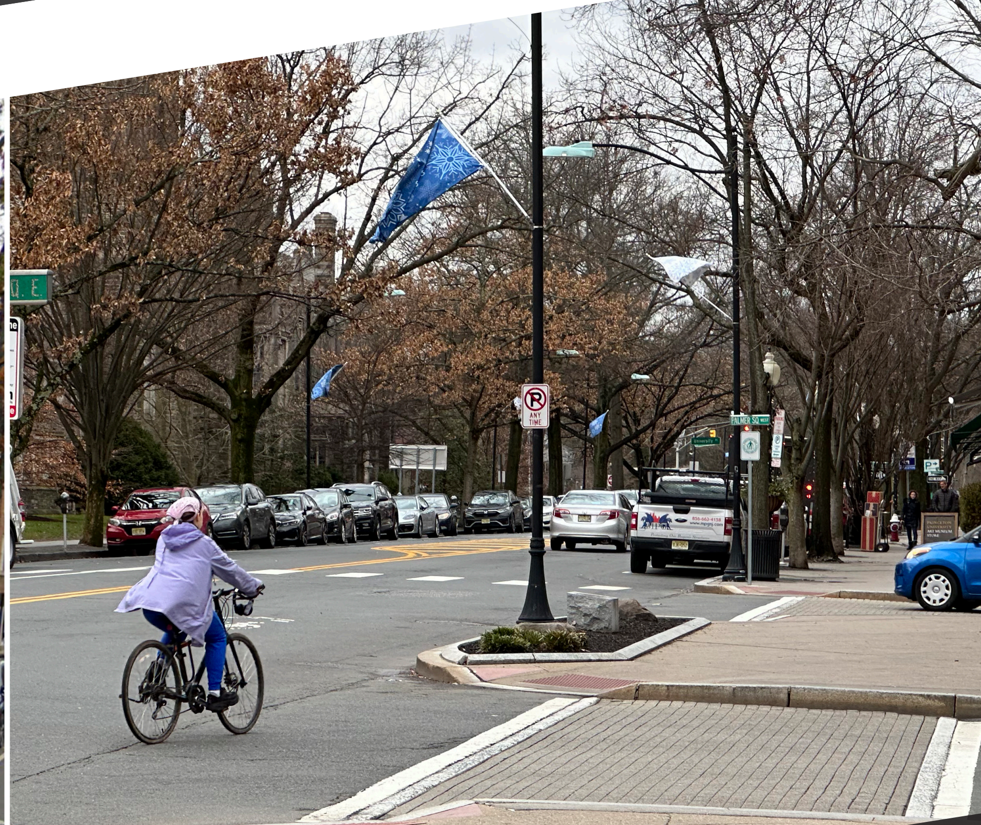
LACK OF BICYCLE INFRASTRUCTURE