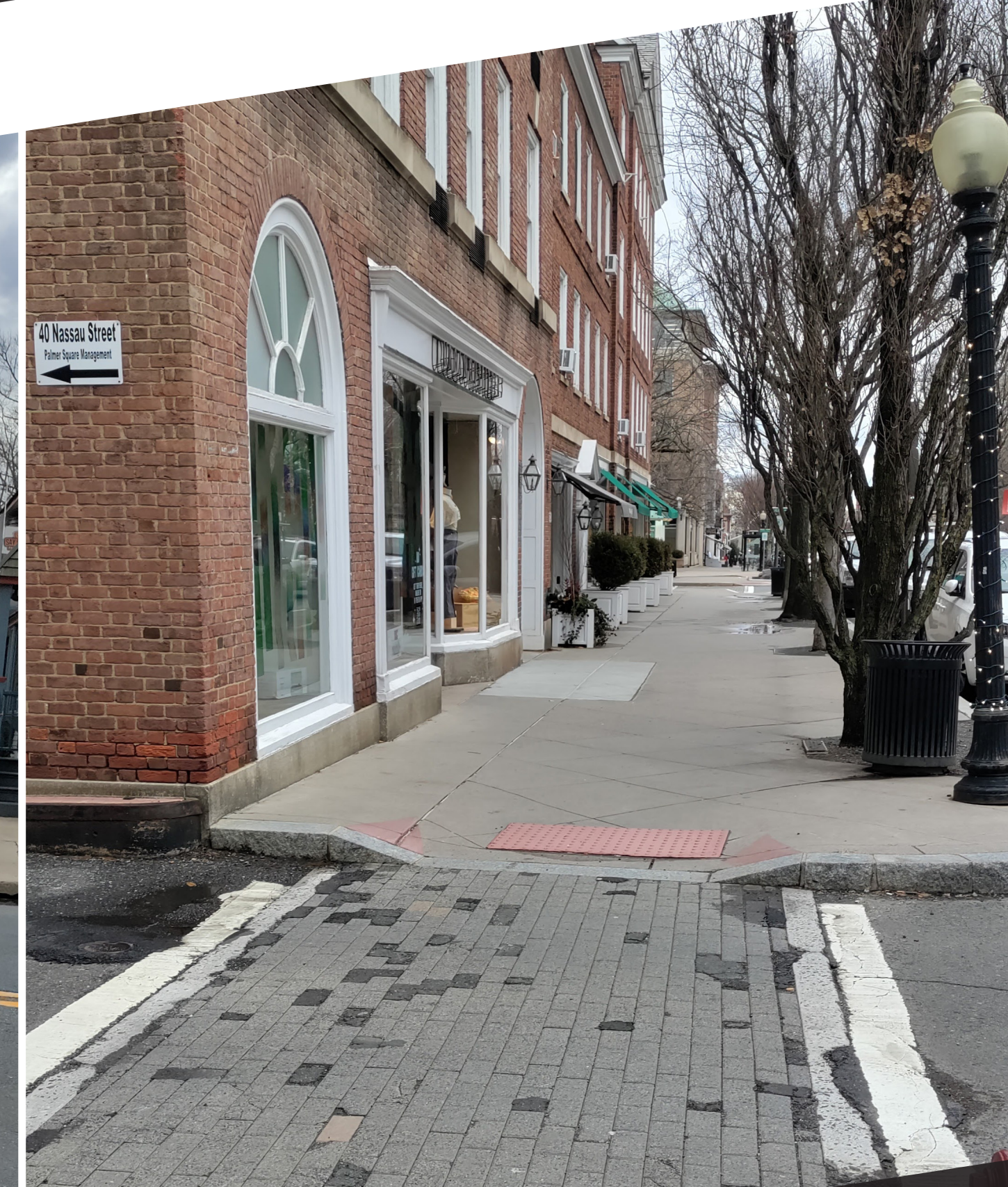
CROSSWALKS IN POOR CONDITION