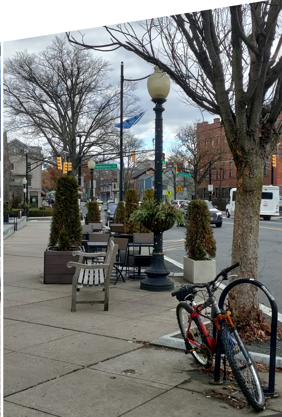
LACK OF COHESIVE FURNITURE PALETTE