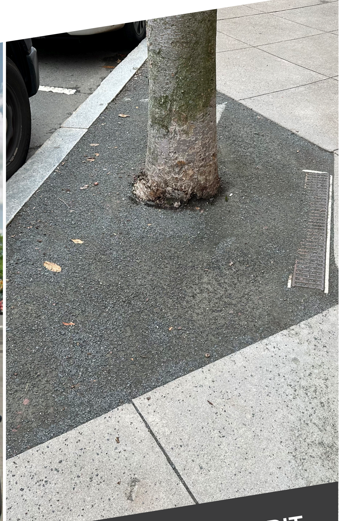
IMPERVIOUS TREE PIT CONDITION