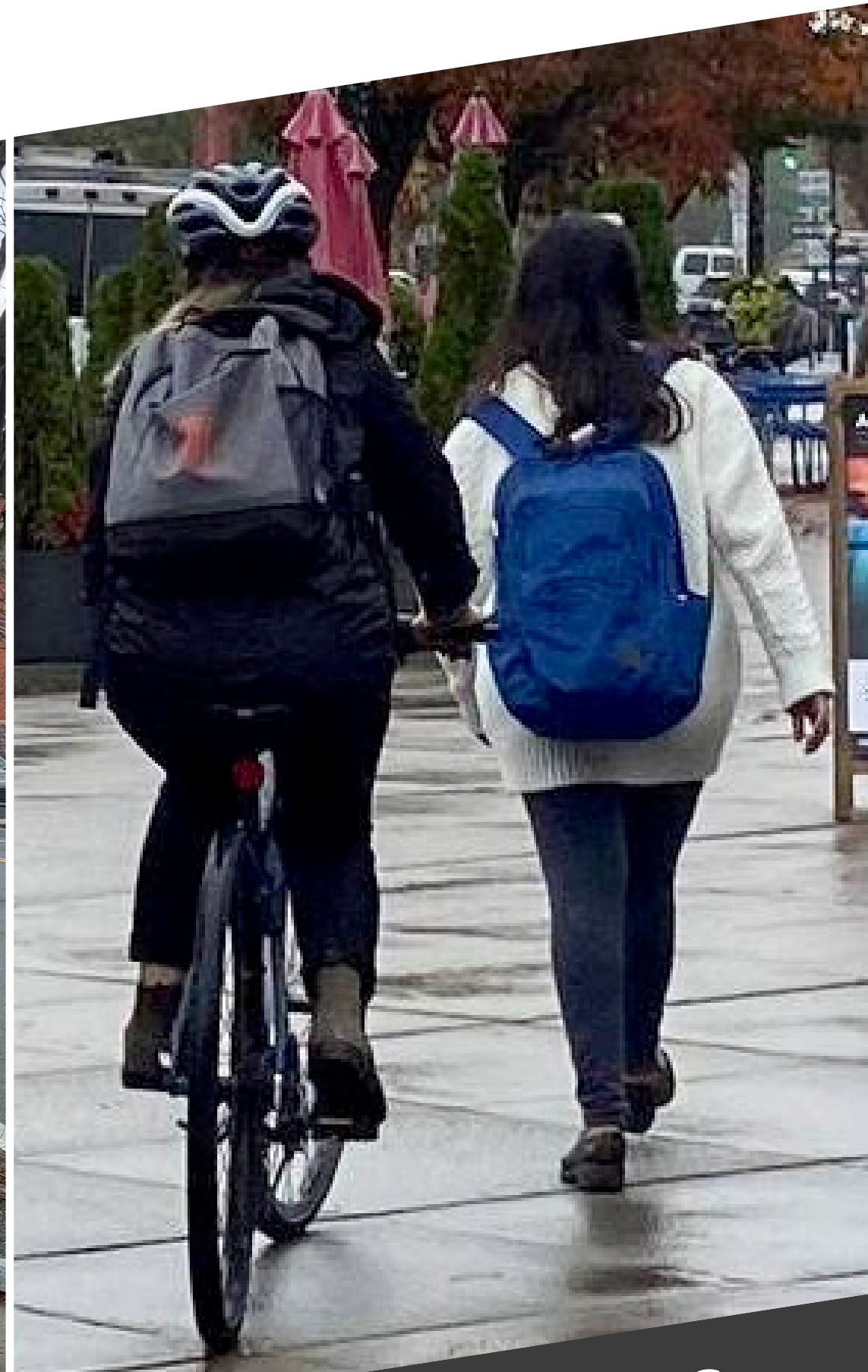
INFLUX OF BIKES AND SCOOTERS ON SIDEWALK