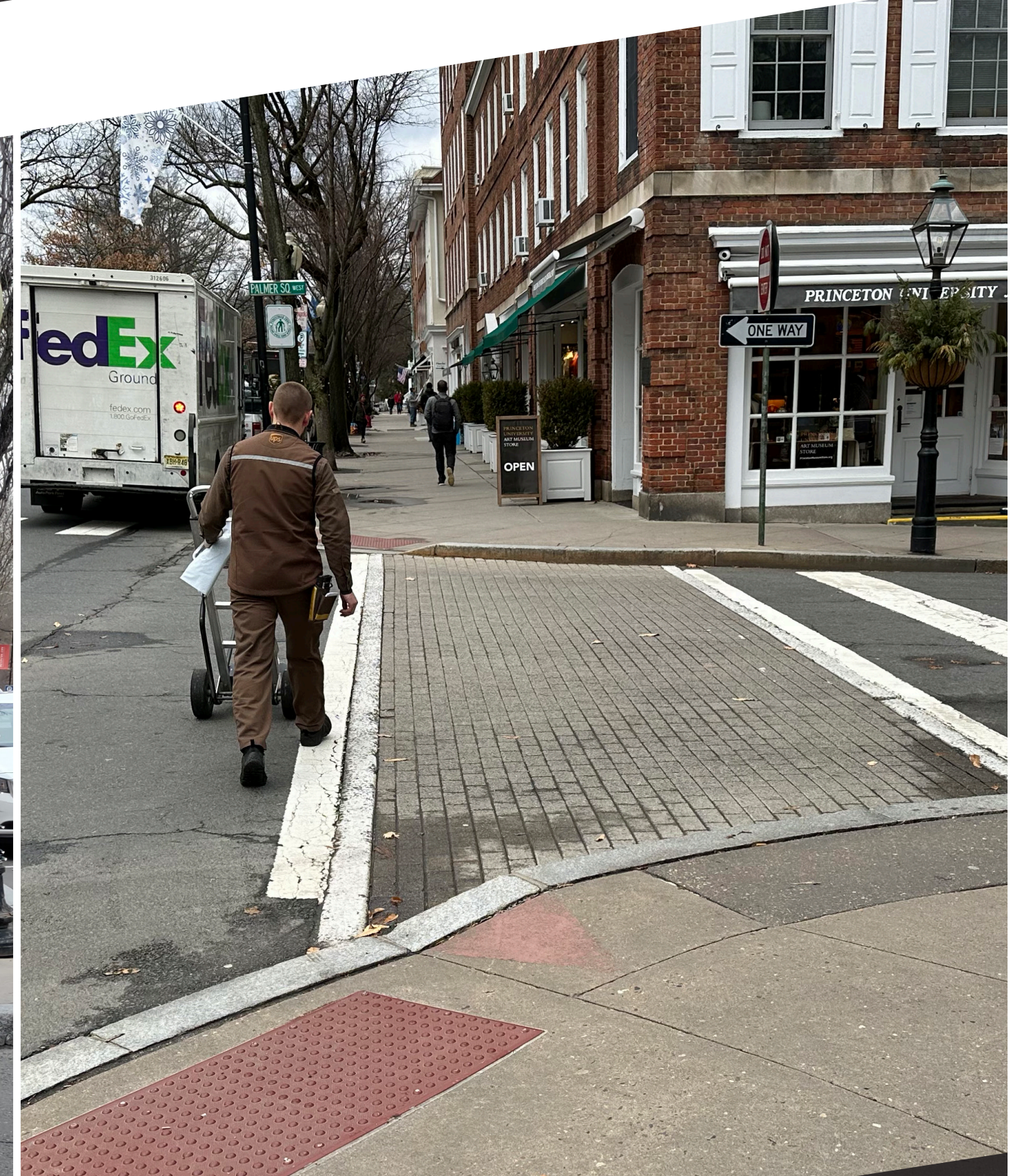
MISALIGNED CURB RAMPS