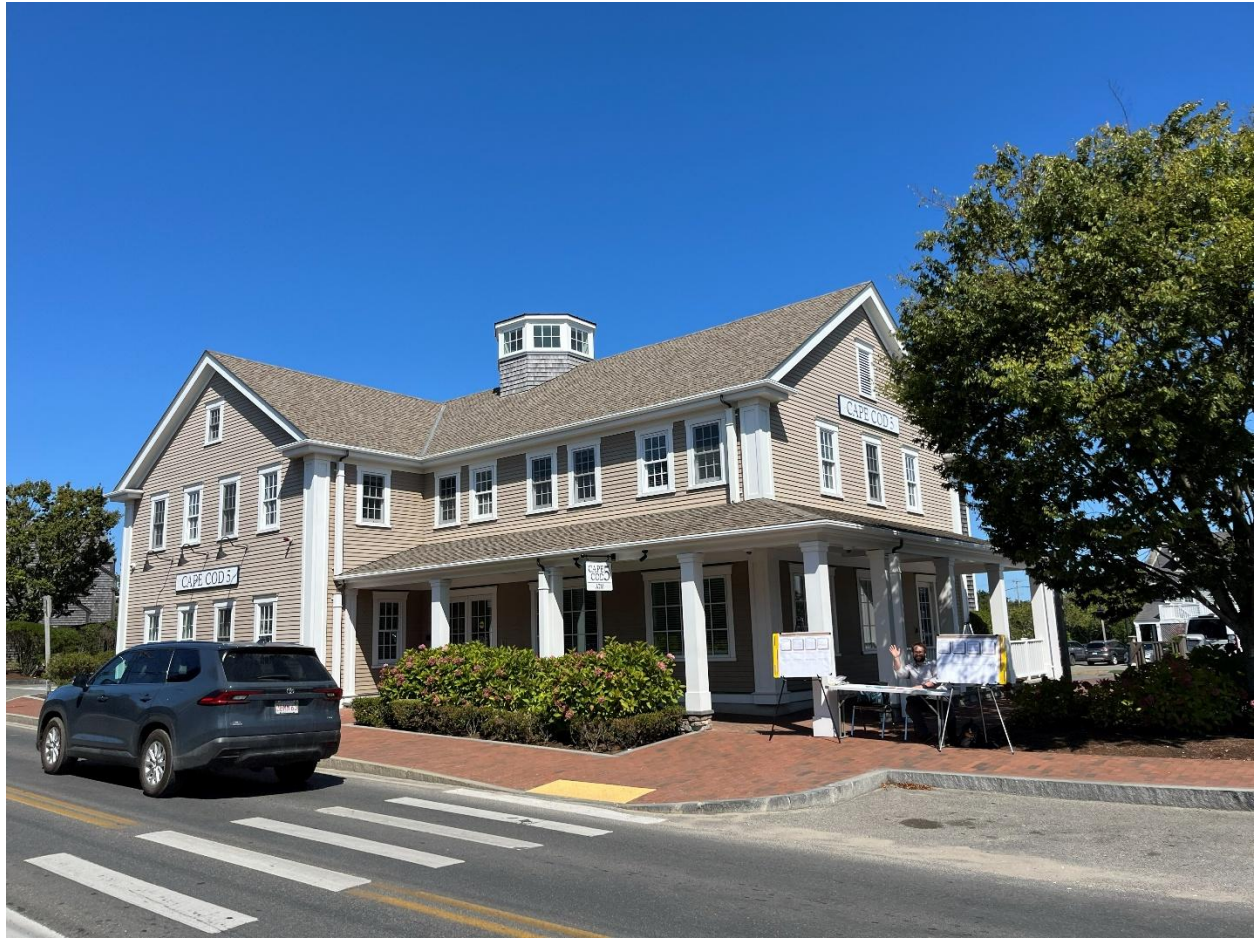
Figure 2: Tabling activity set up outside of Cape Cod 5