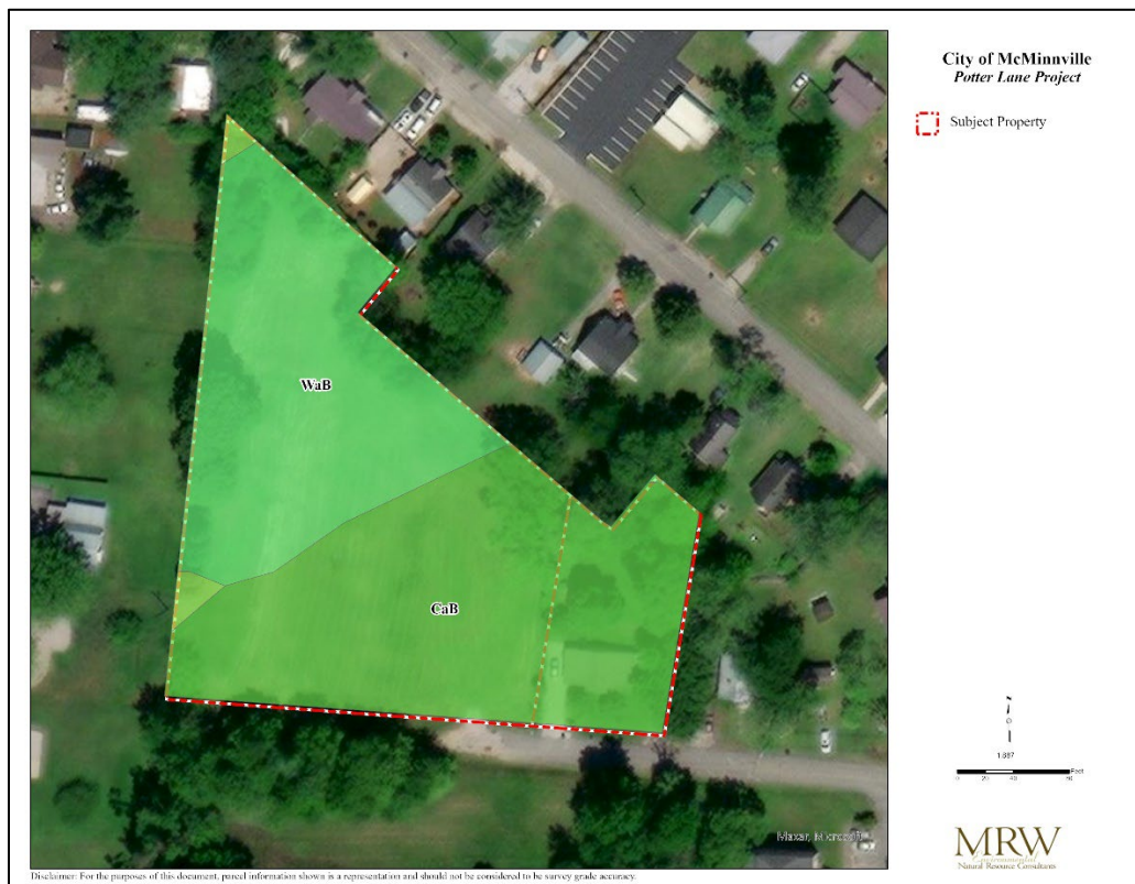
Figure 2. Soil series listed within the Subject Property.

Soils data for the Subject Property indicated two soil series within the Subject Property (Figure 2). Neither the Captina (Ca) nor the Waynesboro (Wa) soil series are considered hydric within Warren County, Tennessee. Following this “office” investigation the Subject Property was assessed by systematically transecting it on foot to determine if jurisdictional waters were present.