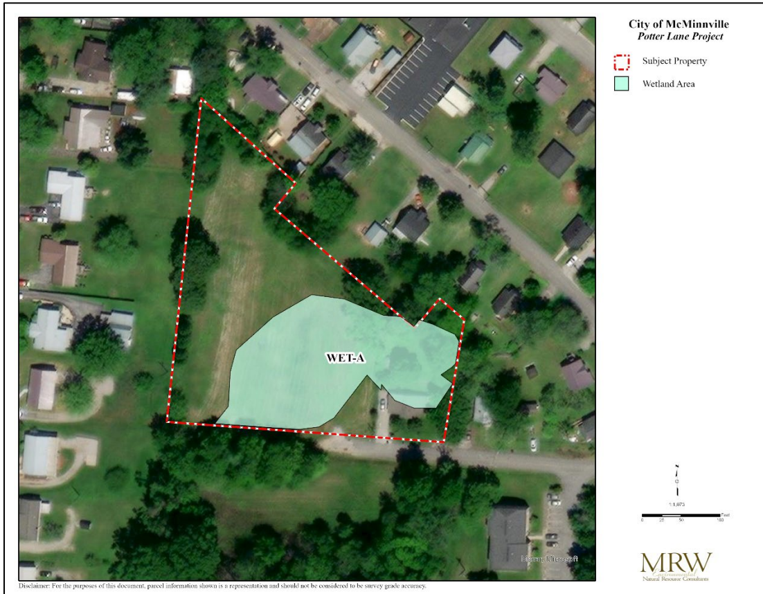
Figure 3. Hydrologic features identified within the Subject Property.

Based on the on-site review, one wetland area was identified within the Subject Property (Figure 4).