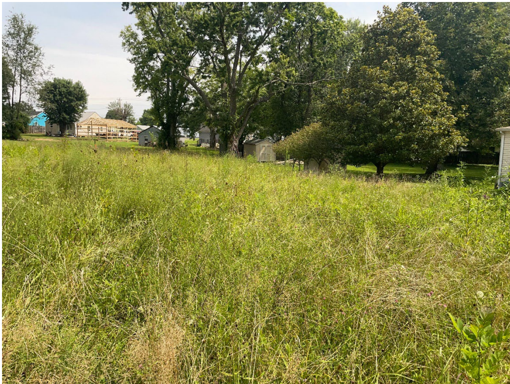
Picture 2. Photograph of WET-A