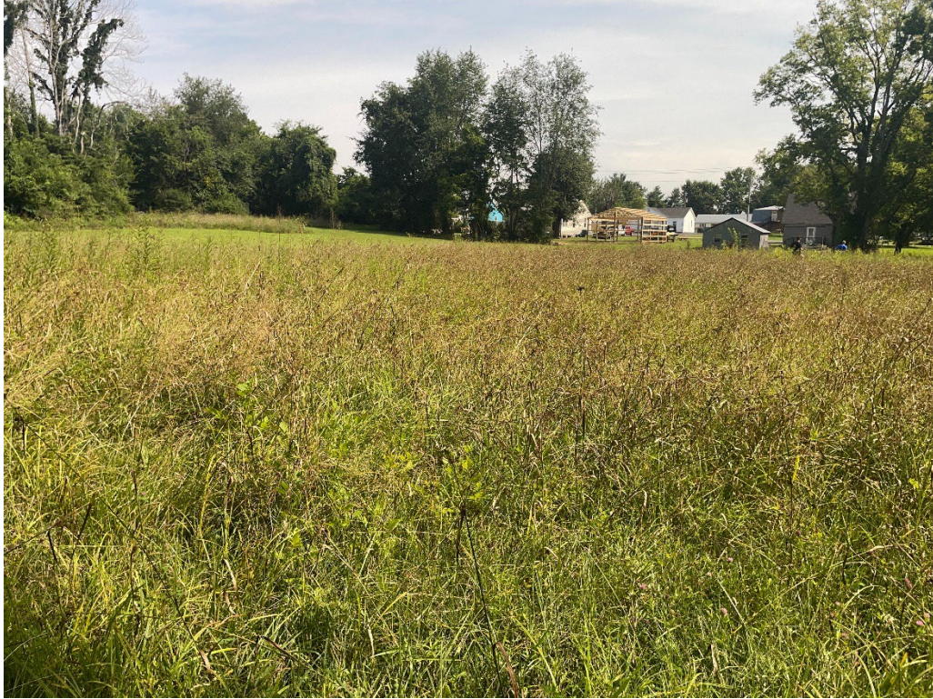
Picture 1. Photograph of WET-A