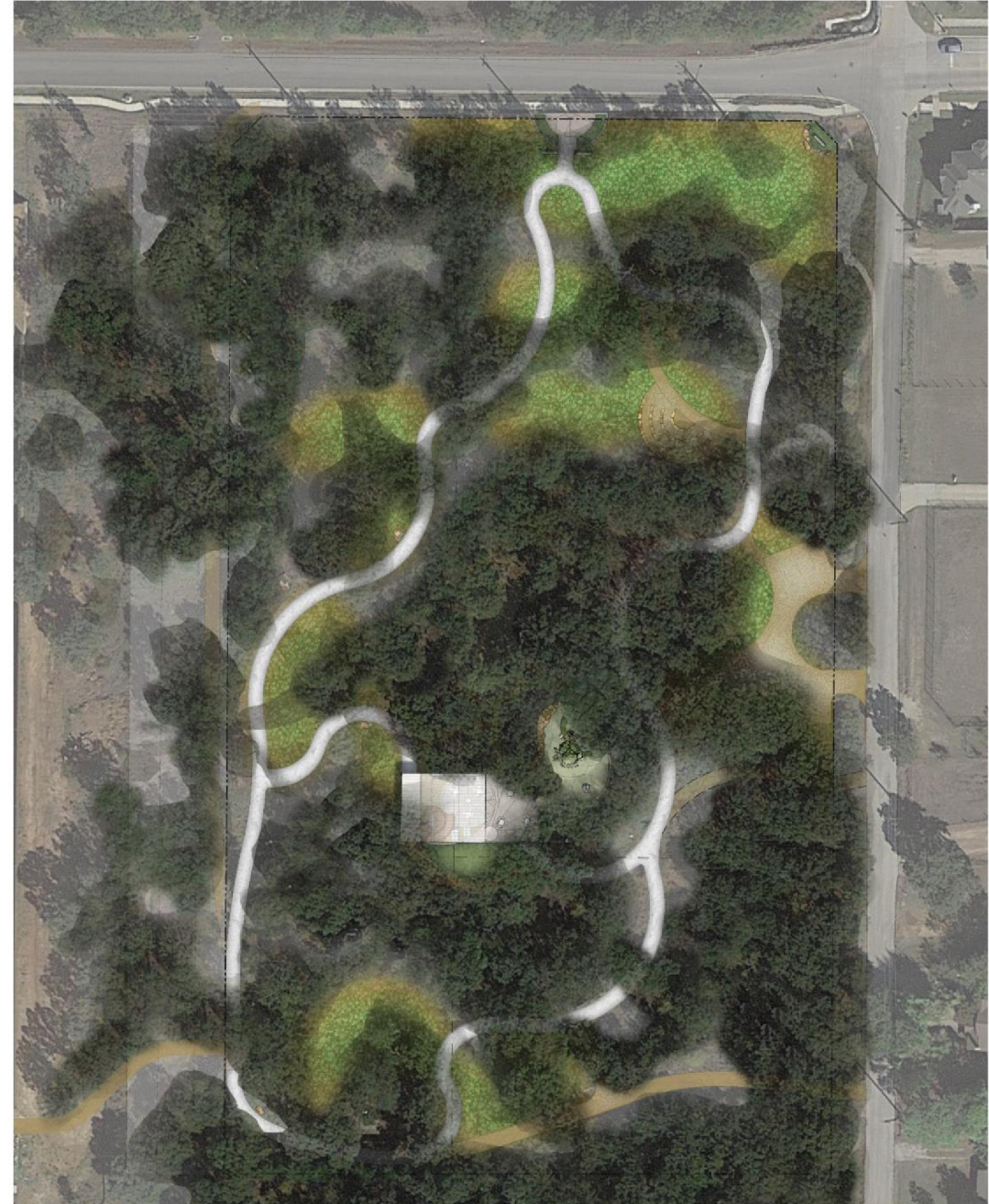
CANOPY COVERAGE EXHIBIT