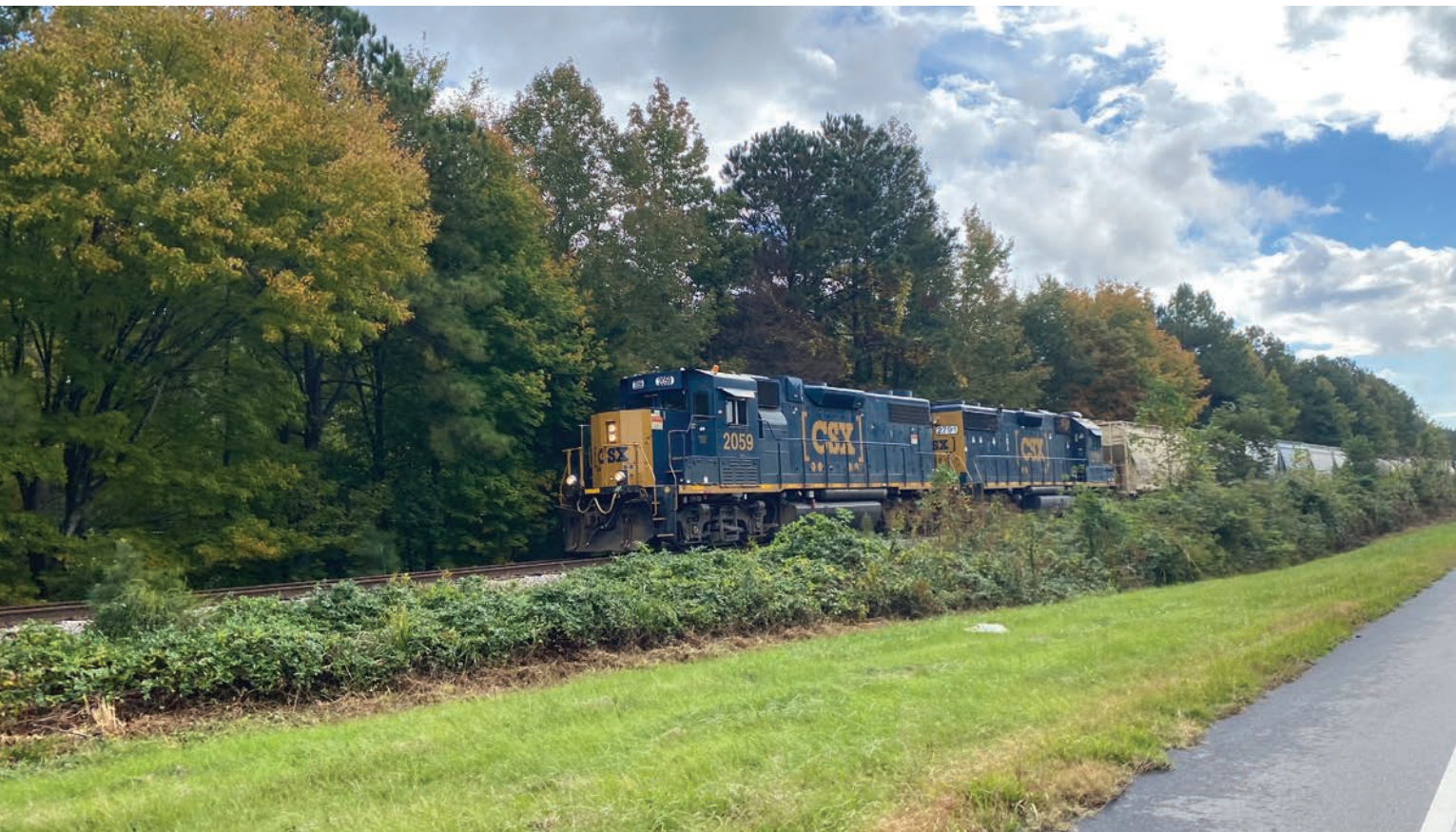
A CSX freight train operating on the S-Line north of Franklinton, NC